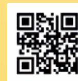
CTCI Web Portal

7Fl., 16, Fushan Road, Beitou District, Taipei 112037, Taiwan, R.O.C. Tel: (886) 2-2662-5858 Fax: (886) 2-2662-2814 Website: www.sec.ctci.com