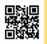
CTCI Web Portal

CTCI Smart Engineering Corporation 7Fl., 16, Fushan Road, Beitou District, Taipei 112037, Taiwan, R.O.C. Tel: (886) 2-2662-5858 Fax: (886) 2-2662-2814 Website: www.sec.ctci.com